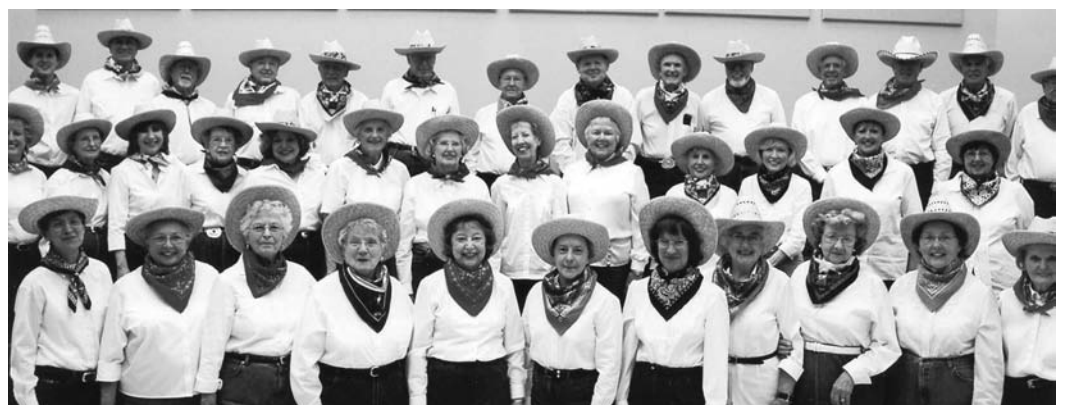
The 2009 Goldenaires Choir

The Goldenaires, TWUMC's senior adult choir, is composed of more than 45 members who love to sing. This active group performs the third Sunday of each month at the 8:30 a.m. worship service in the Robb Chapel. In addition to their regular Sunday performances, The Goldenaires also perform at various church gatherings as well as about 30 community events each year, bringing the gospel to local retirement communities and healthcare centers. The final two performances of their Western music tour will take place on June 1 at The Gathering Place at 10:30 a.m. in Aldersgate Hall and June 3 at the Prime Timers Luncheon at 11:15 a.m. in Wesley Hall.