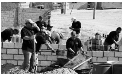
TWUMC Men Building a Home in Juarez